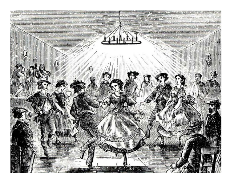
Here's a picture of what it was like when people were dancing in the Fandango room.

The Castro Adobe became famous for having the Fandango room on the second floor. A fandango is a dance as well as a party that was usually held if guests were present for a special celebration or the annual matanza . The Fandango room took up most of the second story except for the bedrooms.