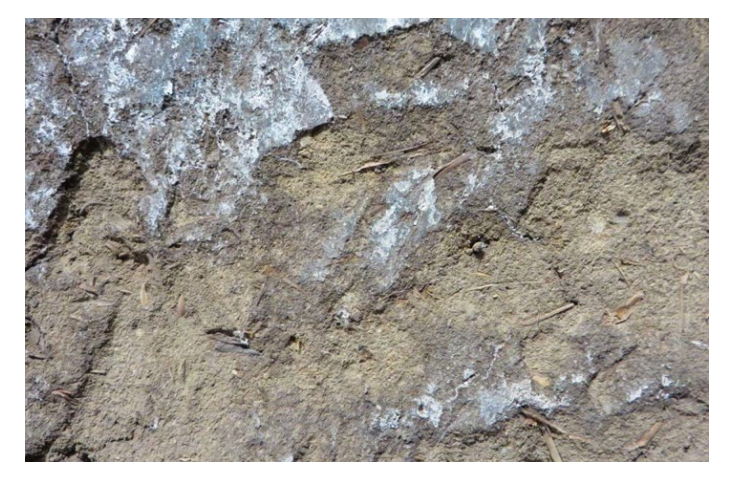
One of of the adobe bricks inside the cocina. One can see the straw that was included in the adobe mixture.

Adobe buildings do not do well with earthquakes or wind blown rain. Many adobe buildings have not survived to this day because of these factors. In Santa Cruz County there are only four adobe buildings left, and one of them is the Rancho San Andrés Castro Adobe in Watsonville. The other three are the Santa Cruz Mission State Historic Park adobe, the Branciforte adobe and the Bolcoff Adobe at Wilder Ranch.