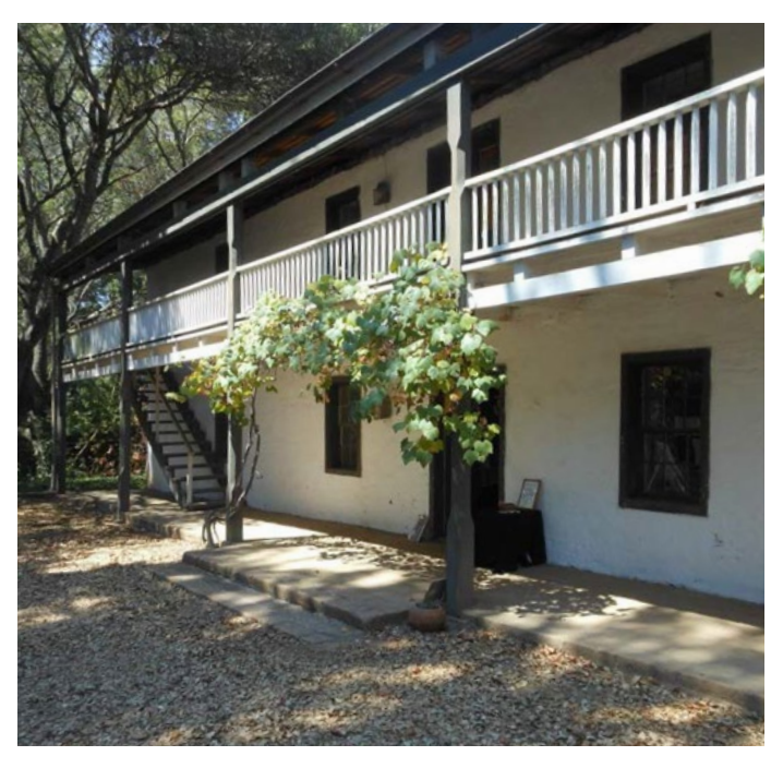
The Rancho San Andrés Castro Adobe today. One can see the steps leading to the second story and the balcony.

The beaches along the coast provided good fishing, as well as embarcaderos for loading hides on boats. The rancho had fertile soil where many crops were grown to feed the family as well as the livestock.