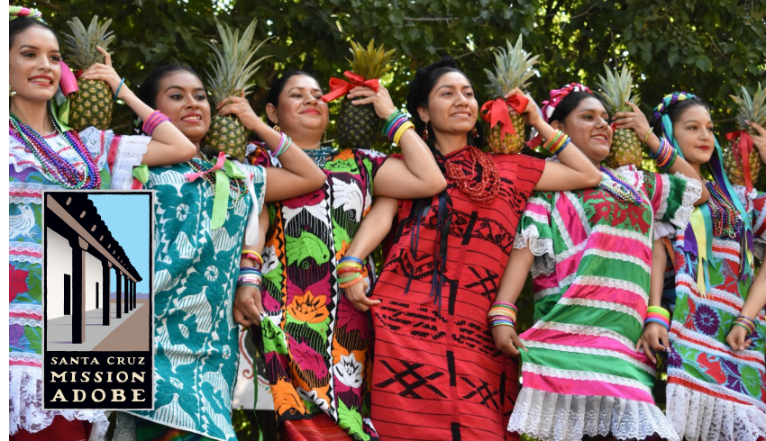
SANTA CRUZ MISSION ADOBE