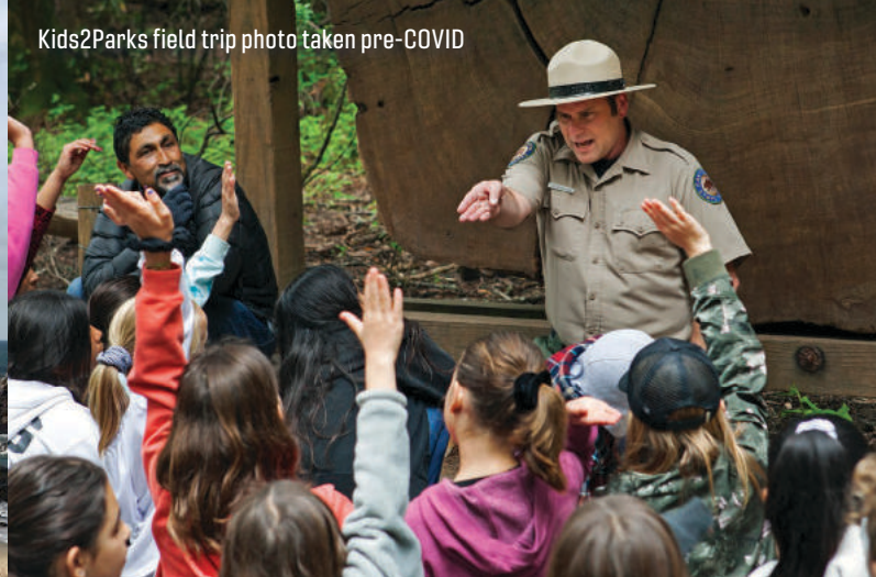
Kids2Parks field trip photo taken pre-COVID