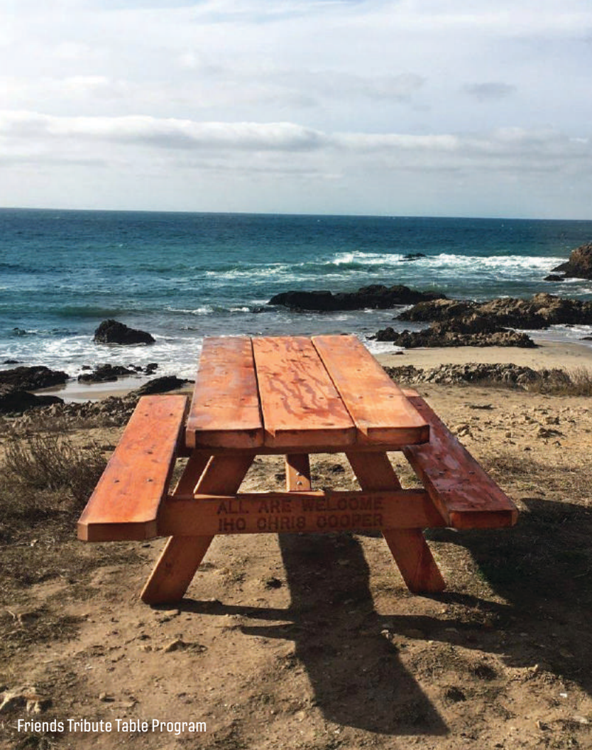
Friends Tribute Table Program